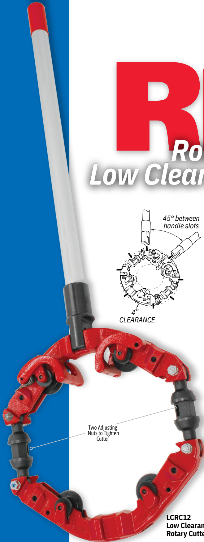
LCRC12 Low Clearance Rotary Cutter